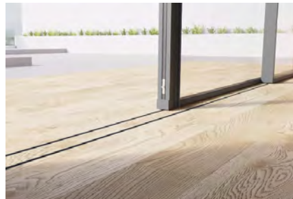
Integrated floor implementation KLAR VISION+