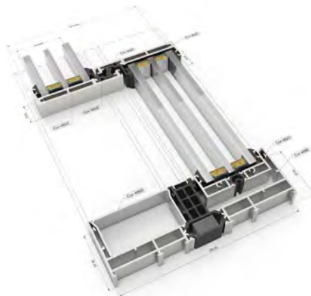
Door- cross-section KLAR VISION+