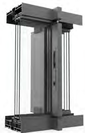
New closing on post 25m KLAR VISION +