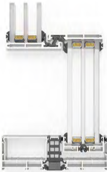
Cotas superior - KLAR VISION+