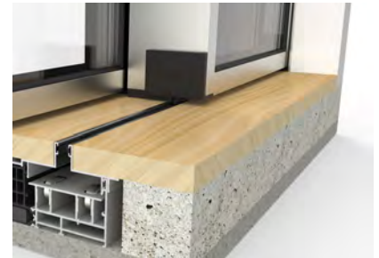
integrated floor render - KLAR VISION+