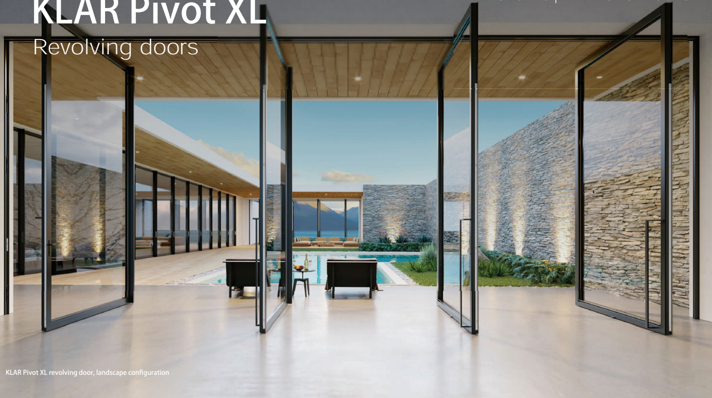
KLAR Pivot XL revolving door, landscape configuration

Even larger unique architectural solutions.